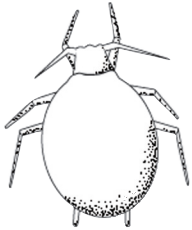
Mummy (Parasite) Tan, bloated body

Treatment Threshold = 4 Greenbugs/Tiller Economic Thresholds for September - December